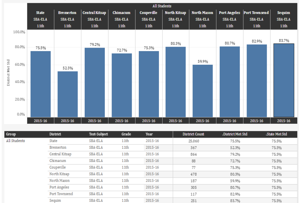
Assessment Data Comparison - District Level -